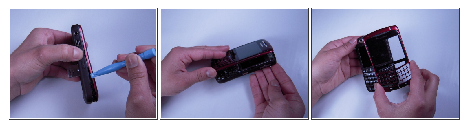
A Be careful not to damage the front cover's plastic clips while trying to separate it from the phone.